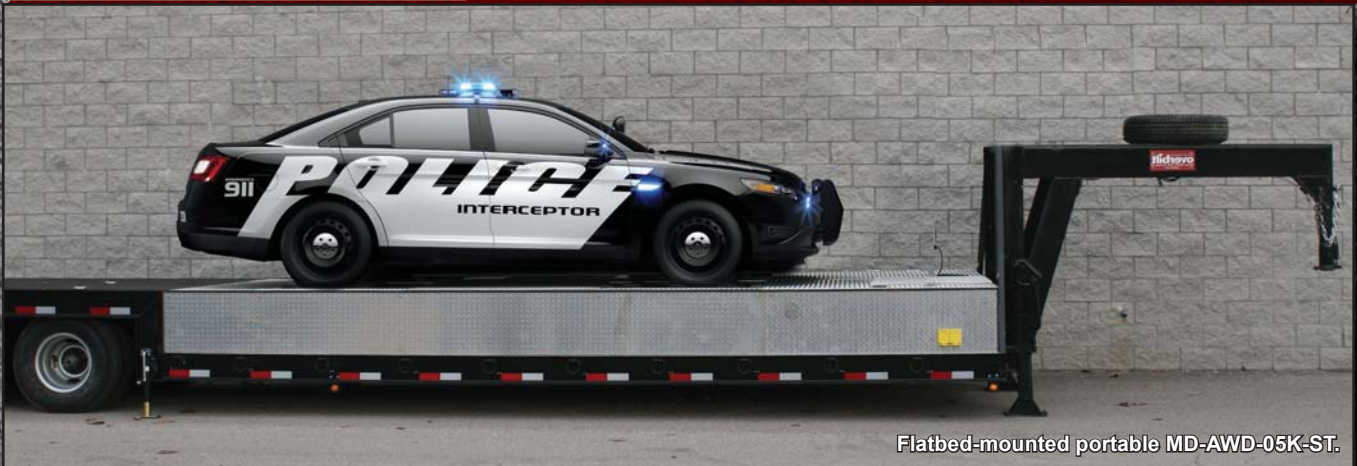
Flatbed-mounted portable MD-AWD-05K-ST.

Mustang manufactures a number of portable versions of our speedometer testers. Depending upon the speedometer tester that is specified, Mustang can offer an enclosed trailer design or a flatbed trailer-mounted portability system to meet your specific application requirements. Mustang's portable systems include every item needed – from wheel chocks to an advanced computer control system – to ensure successful portable operation. A Mustang portable system incorporates every desirable aspect of our traditional speedometer testers into a portable system that can be moved and set-up in a matter of minutes by a crew of only one or two guys.