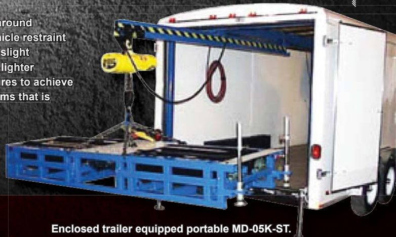
Enclosed trailer equipped portable MD-05K-ST.

Mustang Dynamometer offers the ONLY CERTIFIED AWD SPEEDOMETER TESTER for testing Next-Generation AWD and 2WD traction & stability control vehicles.