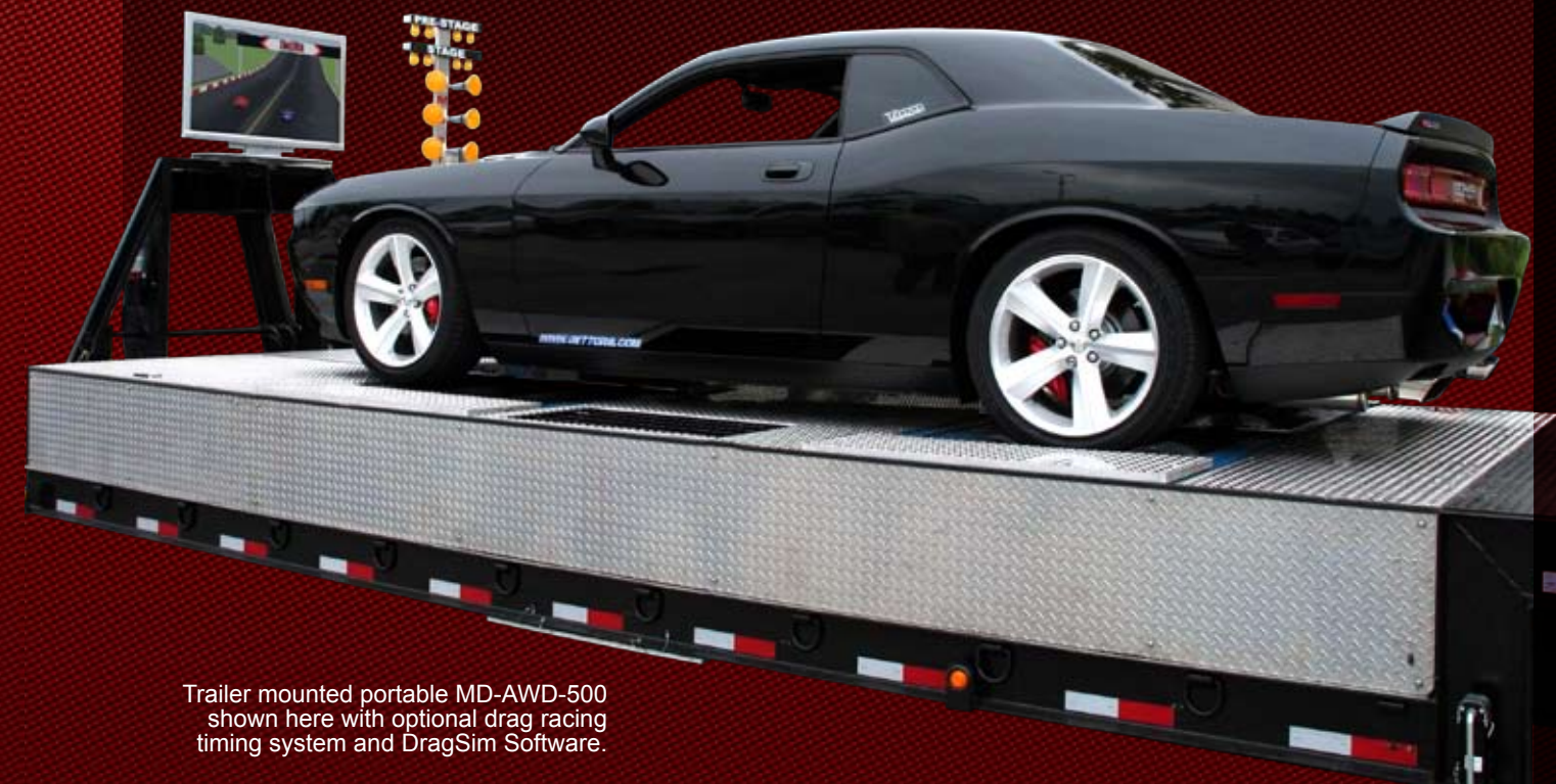
Trailer mounted portable MD-AWD-500 shown here with optional drag racing timing system and DragSim Software.