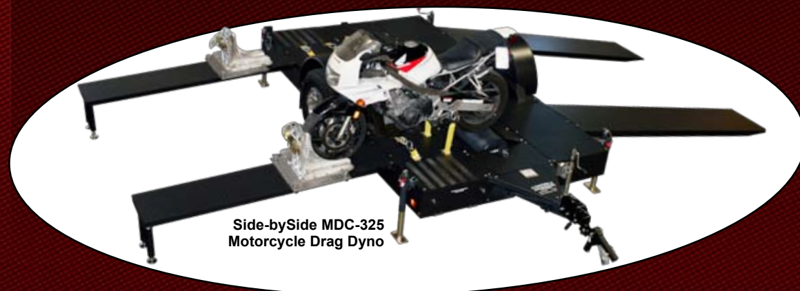
Side-by-Side MDC-325 Motorcycle Drag Dyno

Depending upon the dynamometer that is selected, Mustang can offer an enclosed trailer design or a flatbed trailer-mounted portability system to meet your specific application requirements.