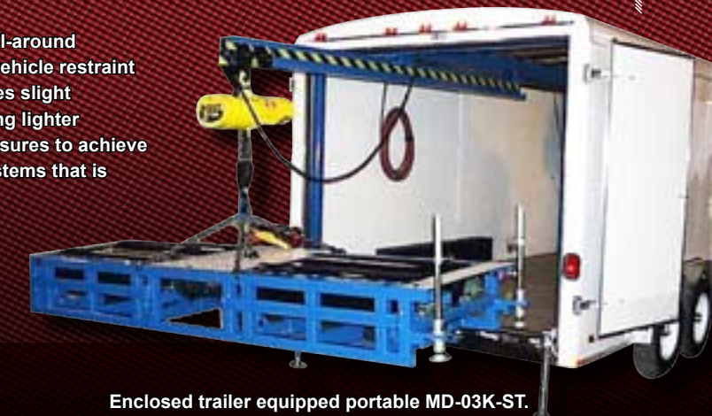
Enclosed trailer equipped portable MD-03K-ST.

Mustang Dynamometer offers the ONLY CERTIFIED AWD SPEEDOMETER TESTER for testing Next-Generation AWD and 2WD traction & stability control police vehicles.