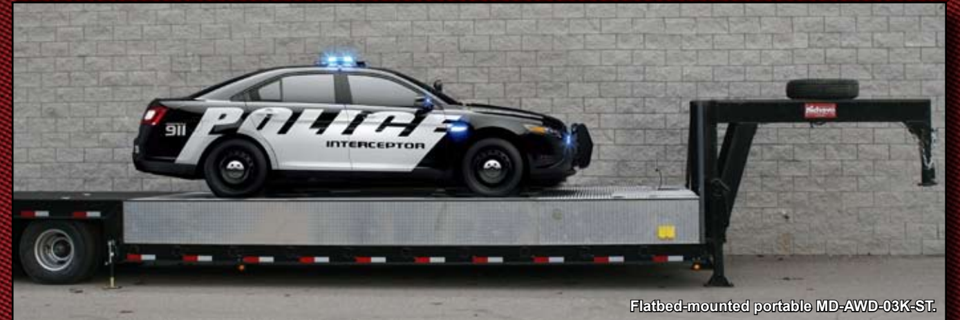
Flatbed-mounted portable MD-AWD-03K-ST.

Mustang manufactures a number of portable versions of our speedometer testers. Depending upon the speedo tester that is specified, Mustang can offer an enclosed trailer design or a flatbed trailer-mounted portability system to meet your specific application requirements. Mustang's portable systems include every item needed – from wheel chocks to an advanced computer control system – to ensure successful portable operation. A Mustang portable system incorporates every desirable aspect of our traditional speedometer testers into a portable system that can be moved and set-up in a matter of minutes by a crew of only one or two guys.